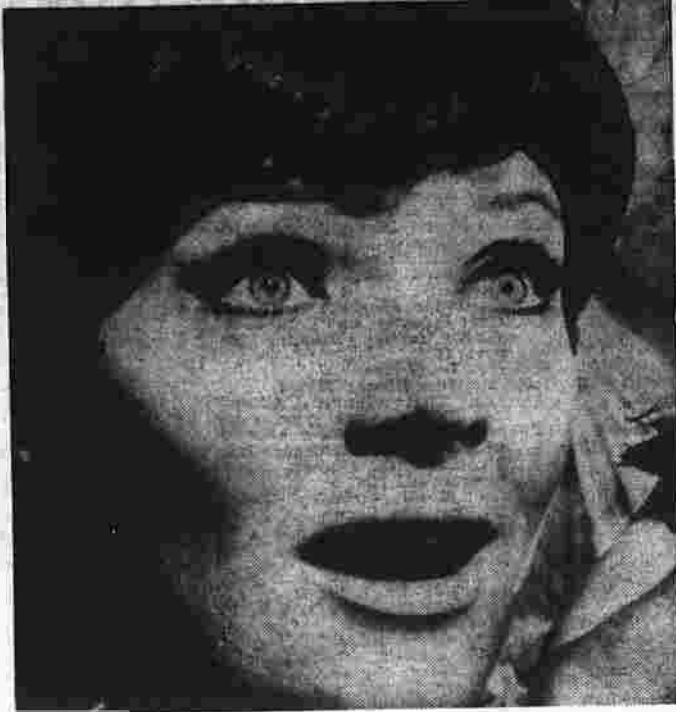
Actress Polly Bergen is a guest on "The Red Skelton Show" on Tuesday night 8:30 to 9:30 p.m. on CBS.