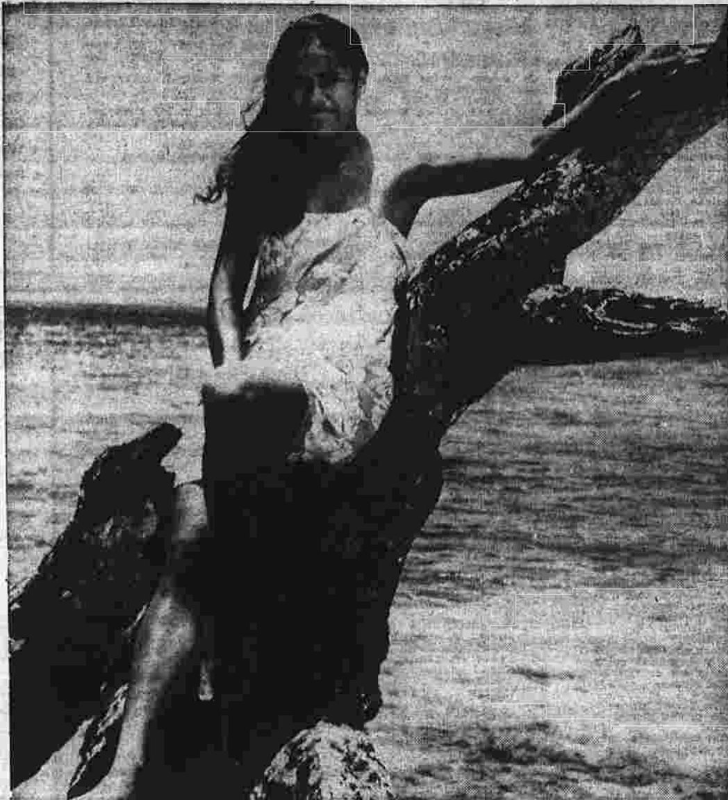
A native in CBS' "Gauguin in Tahiti: The Search for Paradise" Tuesday 10-11 p.m. The special focuses on the painter's years on the island.

"It also helps if you are not a show business type. Now I grew up in a show business family, got my schooling in vaudeville and have been an entertainer all my life. Yet many of my interviews portray me as a high school teacher kind of a guy. That sort of an atmosphere helps when you are doing a late night show."